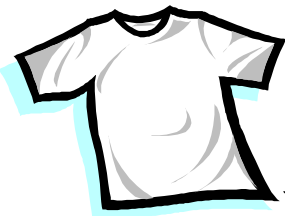
2008 Official Bike & Hike T-Shirt

All Incentives include gifts from previous levels.