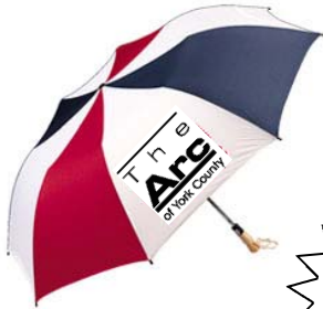
Large 58" folding umbrella with auto-open