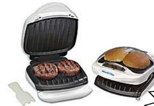
George Foreman Indoor 'Champ' Grill with Bun Warmer