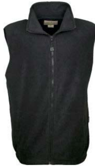
Embroidered Fleece Vest Jacket with full front zipper