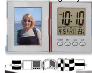
Clock Photo Frame featuring digital clock w/day, month and temp. Open it 360 degrees and the clock and frame magically switch sides