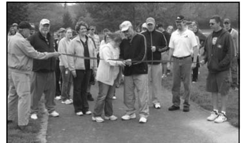
ABOVE — The ribbon cutting that officially started the 2008 Bike & Hike.

If you, or someone you know, would like to sign up for ECRIN, simply contact The Arc of York County at (717) 846-6589 to receive an ECRIN form.