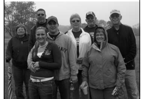
BELOW — For the second straight year, the Bike & Hike’s top fundraising team was the Dickies, raising $2,350.