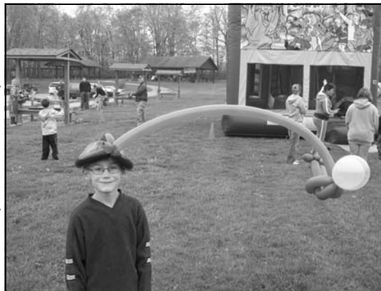
A young Bike & Hike participant enjoys the atmosphere at The Arc of York County's 2008 Bike & Hike.

There were also several local schools districts that held their own Bike & Hike. They included: Spring Grove, York Suburban, and LIU's Yorkshire Academy.