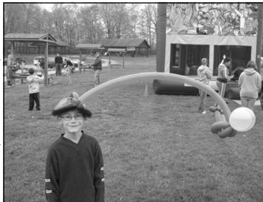
A young Bike & Hike participant enjoys the atmosphere at The Arc of York County's 2008 Bike & Hike.

There were also several local schools districts that held their own Bike & Hike. They included: Spring Grove, York Suburban, and LIU's Yorkshire Academy.